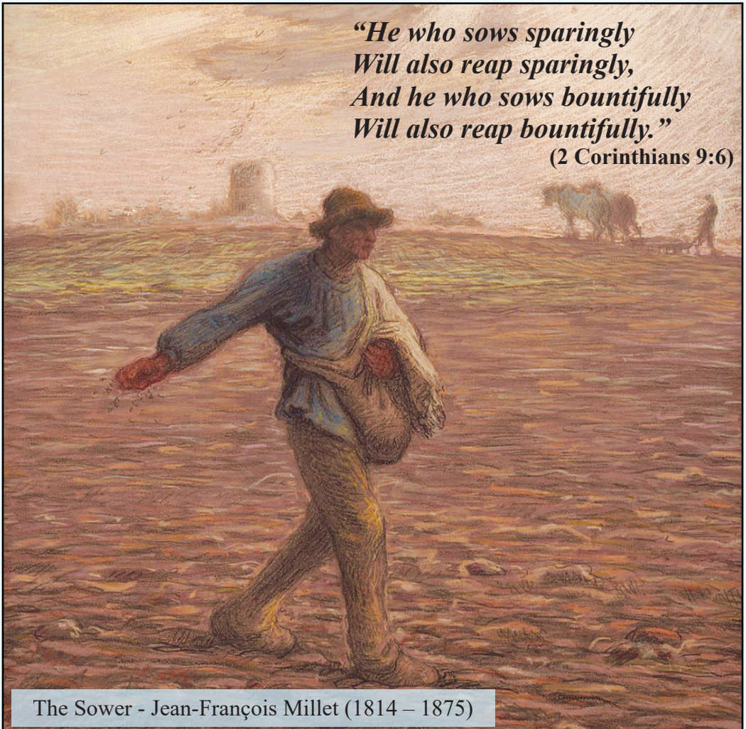
The Sower - Jean-François Millet (1814 – 1875)