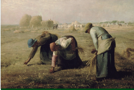
The Gleaners - Jean Francois Millet

The cover of this issue of the Legio Sanctae Familiae newsletter features the work of the French artist Jean François Millet. Some of his paintings will be recognised by Catholics especially, 'The Gleaners' and 'The Angelus'. The Gleaners is based on the Old Testament 'right' of the poor to 'glean' the fields by collecting what was left over after the harvest. The Angelus shows a couple working in the field with a church in the background. They have heard the church bell ringing and have stopped to pray the Angelus together.