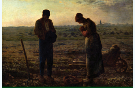
The Angelus - Jean Francois Millet

This month's front cover shows a sower out sowing his seed. Our Lord used the image of a sower for one of his parables.