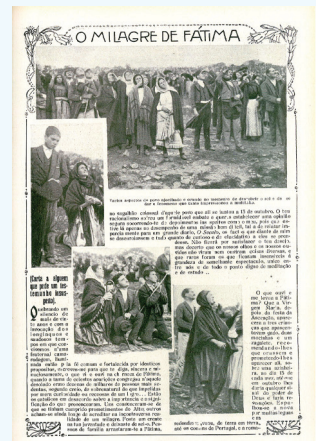
Page from Ilustração Portuguesa, newspaper edition of October 29 th , 1917 with pictures of people looking at the miracle of the sun in Fatima on October 13th, 1917.

“You have seen hell where the souls of poor sinners go. To save them, God wishes to establish in the world devotion to my Immaculate Heart. If what I say