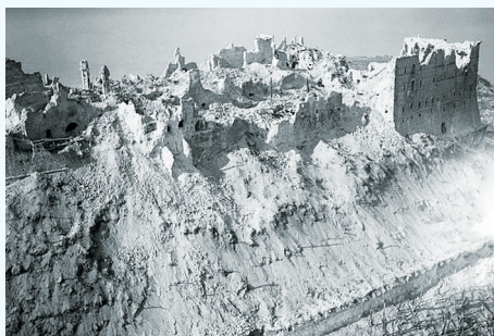
The destruction of the Benedictine Monastery of Monte Cassino during World War 2

I was reminded of this during my recent presentations where I looked at the birth statistics in Ireland. I always presumed that when Our Lady spoke of various nations being annihilated, that she was speaking of war. However, current birth rates across the world show that most nations have now fallen below replacement level. If the birth rates do not rise, these nations will simply cease to exist. The people have ignored God’s first words to mankind - “Increase and multiply, and fill the earth” (Genesis 1:28)