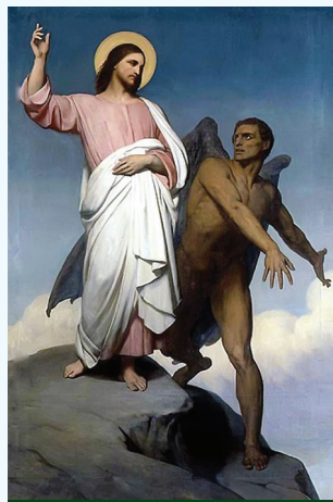
Ary Scheffer (1795-1858) Temptation of Christ

In both St Matthew and St Luke’s Gospel, Christ is tempted by the devil after forty days of fasting. It is where the season of Lent comes from. At one point the devil shows Jesus all the kingdoms of the world telling Him that he has been given the power of these kingdoms and that he gives it to whom he wills. The condition for Christ to attain these powers is for Him to fall down and worship Satan. Christ rejects Satan’s deceitful offer and dismisses him.