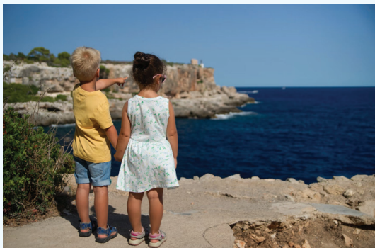
This is a picture of a Boy and a Girl Regardless of what the Government tells you.

One of the male TDs who has been pushing for the revision of sex education in Irish schools recently became a father. His partner gave birth to a boy. This father publicly declared that he does not want to limit his baby by telling him he is a boy. The child's parents believe that their boy will decide whether or not he is a boy or a girl. This TD co-sponsored a private members Bill on Objective Sex Education in 2018, which stated that the Minister must ensure that "the curriculum is factual and objective, age appropriate, and not gender normative."