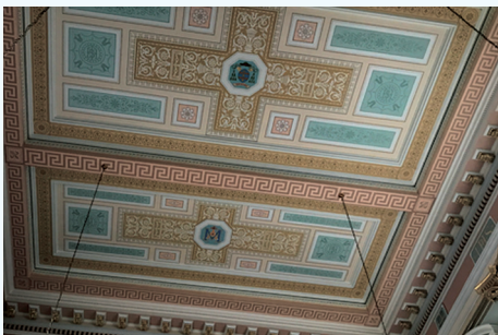
Restored artwork on Church Ceiling

Ten years have passed and the restoration continues. At some point in the history of this church, it was decided to paint over all of the intricate stencilled artwork in the church. Today, this beautiful hand painted artwork is being restored and updated with the crests of the Institute of Christ the King and their patron saints.