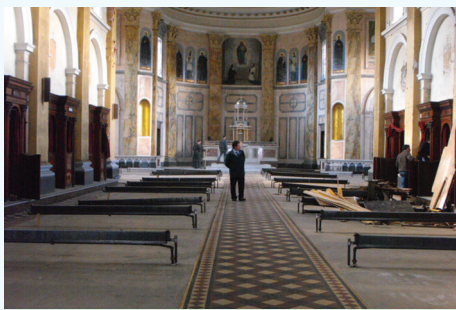
Sacred Heart Church - September 2012

The plans to commercially develop Sacred Heart Church in Limerick fell through, and the Church was put back up for sale in 2011. The Institute of Christ the King, Sovereign Priest, who had been travelling from Italy to celebrate a weekly Latin Mass in St Patrick's Church in Limerick, purchased Sacred Heart Church in 2012.