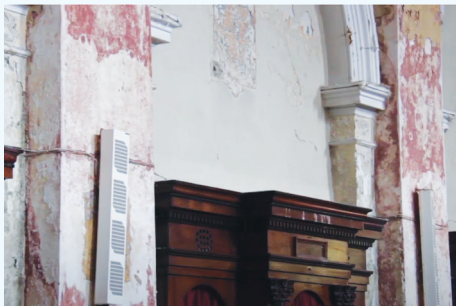
The flaking paint is removed

This church could be seen as a symbol of the state of the Catholic faith in Ireland. Yet, instead of focusing on how bad things were, the Institute of Christ the King saw the potential. They saw the house of God which He used to frequent every day at Holy Mass and where he resided in the tabernacle for one hundred and thirty seven years, in a state of disrepair. They decided to restore God's house and to invite Jesus to return through the sacraments of His Catholic Church.