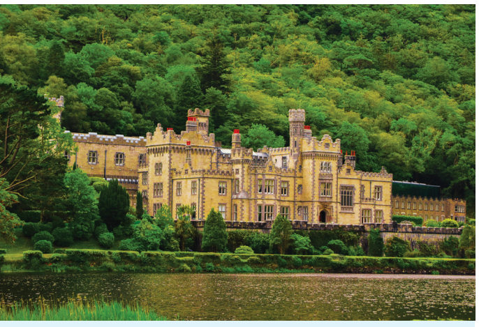
Kylemore Abbey - Catholic Girls School - Galway

The difficulty I have with all of this is that nobody within the Irish Catholic hierarchy wants to take responsibility for the failure of the Catholic schools to play their part in handing on the Catholic faith.