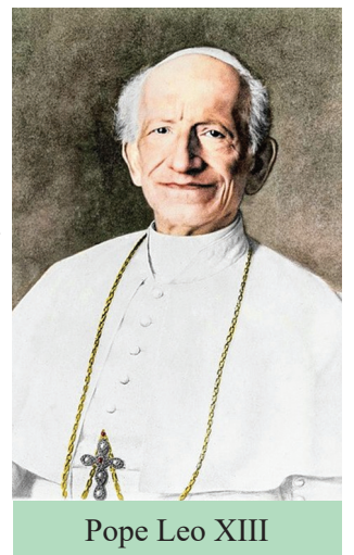
Pope Leo XIII

"Among the prerogatives conferred on His Church by Christ is the gift of indefectibility. By this term is signified, not merely that the Church will persist to the end of time, but further, that it will preserve unimpaired its essential characteristics. The Church can never undergo any constitutional change which will make it, as a social organism, something different from what it was originally.