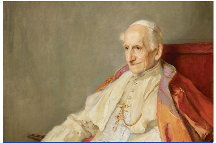
Pope Leo XIII - Philip de Laszlo (1869-1937)

“Sacrifice yourselves for sinners; and say often, especially when you make some sacrifice: ‘O my Jesus, it is for love of Thee, for the conversion of sinners and in reparation for sins committed against the Immaculate Heart of Mary I offer this sacrifice to Thee.’” (Our Lady, third apparition at Fatima, 13th July, 1917)