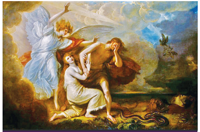
The Expulsion of Adam and Eve - Benjamin West (1738 -1820)

God knew from the beginning the extent of evil that would enter into the world through man’s misuse of